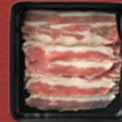
Black Angus Short Plate