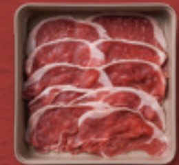
Australian Lamb Shoulder

All diners at the same table are required to order the same set. À la carte items are available.