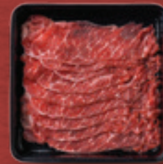
Black Angus Chuck Roll