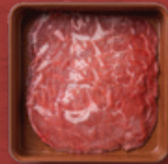
Beef Chuck Roll

Time is limited to 90 minutes per table for lunch, and 120 minutes for dinner. We charge an additional RM10 ++ per 15 minutes thereafter.