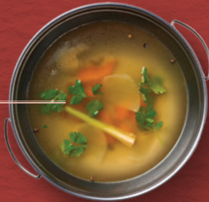
Mushroom Soup (v)