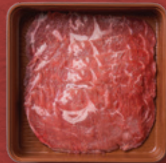
Beef Chuck Roll

Time is limited to 90 minutes per table for lunch, and 120 minutes for dinner. We charge an additional RM10 ++ per 15 minutes thereafter.