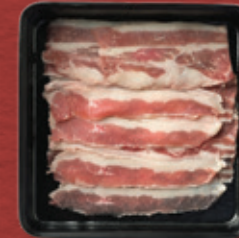
Black Angus Short Plate