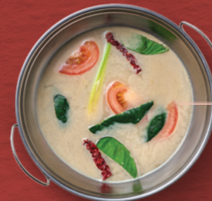
Tom Kha Gai Soup