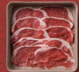
Australian Lamb Shoulder

All diners at the same table are required to order the same set. À la carte items are available.