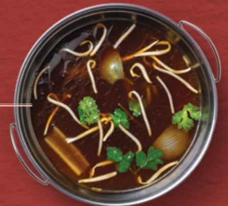
๓๓ Gaeng Kati Soup

Chicken Soup, Cinnamon, Star Anise, Cardamom, Pandan Leaves