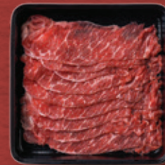
Black Angus Chuck Roll