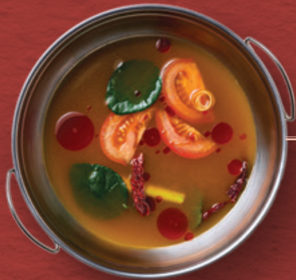
Red Tom Yum Chicken Soup