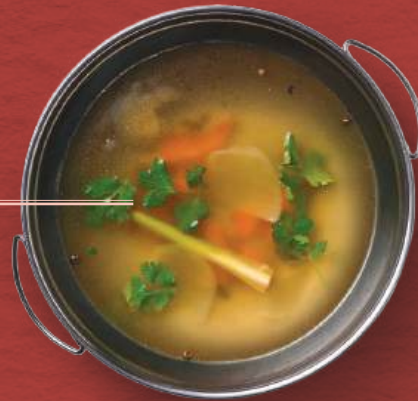
Mushroom Soup (v)