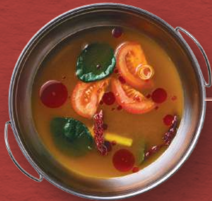
Red Tom Yum Chicken Soup