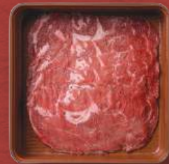
Beef Chuck Roll

Time is limited to 90 minutes per table for lunch, and 120 minutes for dinner. We charge an additional RM10 ++ per 15 minutes thereafter.