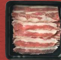
Black Angus Short Plate