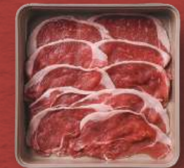
Australian Lamb Shoulder

All diners at the same table are required to order the same set. À la carte items are available.