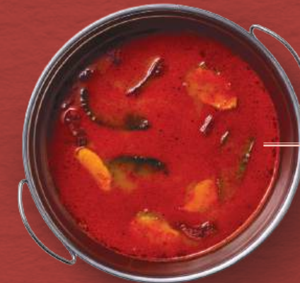
๓๓ Gaeng Kati Soup