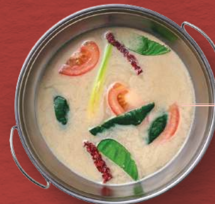
Tom Kha Gai Soup