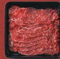
Black Angus Chuck Roll